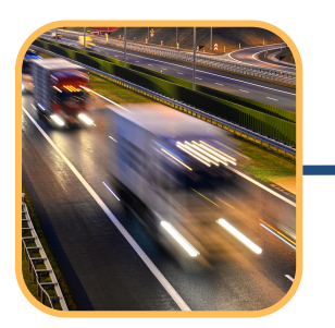
EV Fast Track